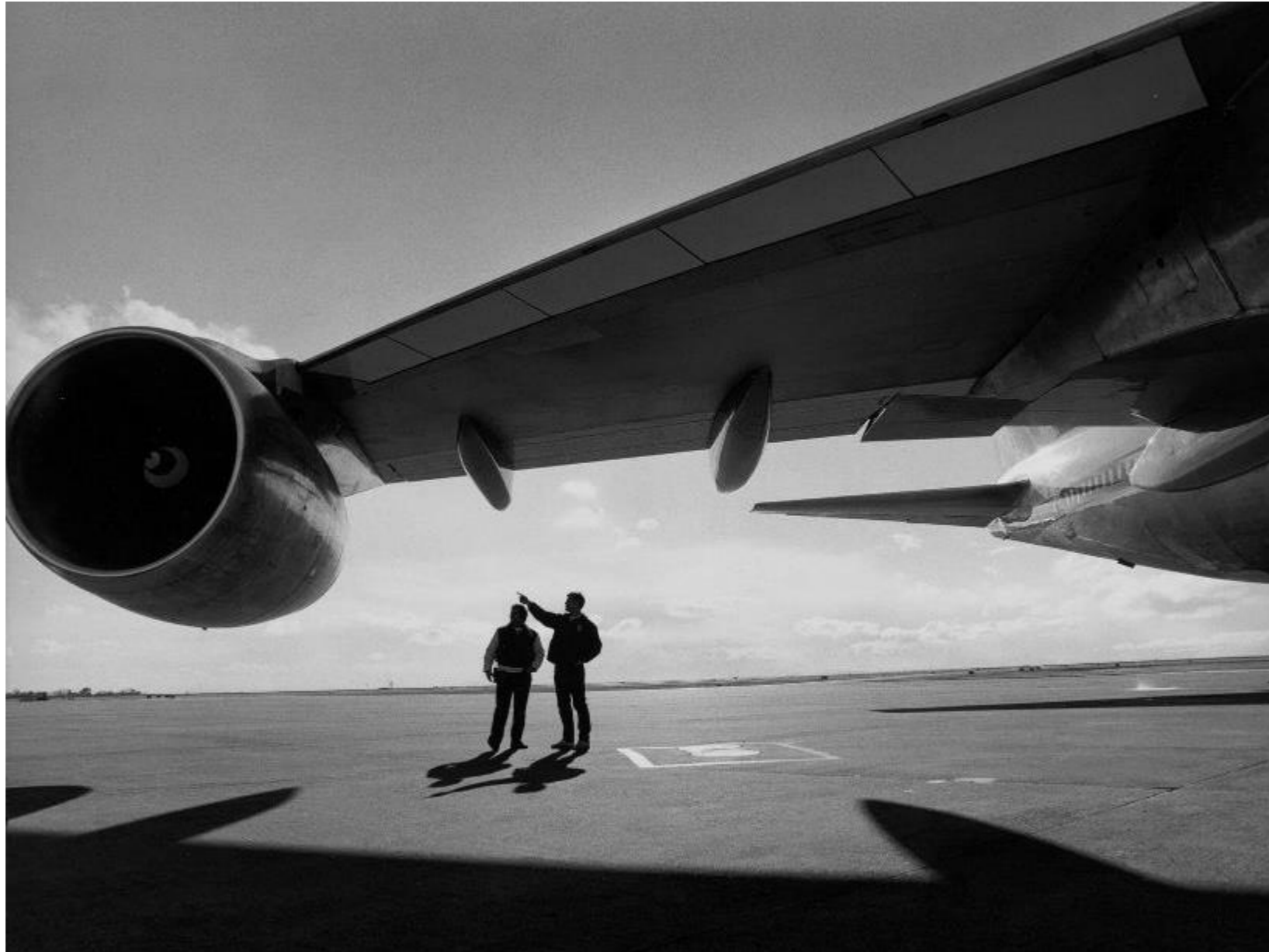
Man pointing at aeroplane engine