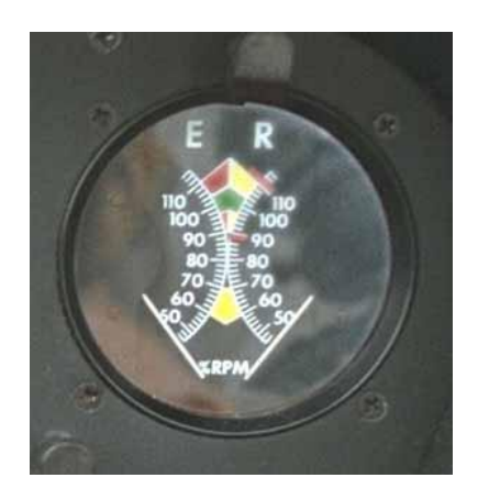
Figure 3: Dual needle Engine/RRPM tachometer

2.1.1 The pilot reported to the passenger that there was a fault with the governor, requiring them to return to the fishing vessel. The governor system senses engine RPM and applies corrective input forces to the [on the collective] throttle. When RPM is low, the governor increases throttle and vice versa<sup>12</sup>. A number of faults can give rise to a suspected governor fault, which tend to be indicated to the pilot through the dual engine/RRPM tachometer positioned at the top right of the instrument panel as fluctuating or abnormal needle movements.