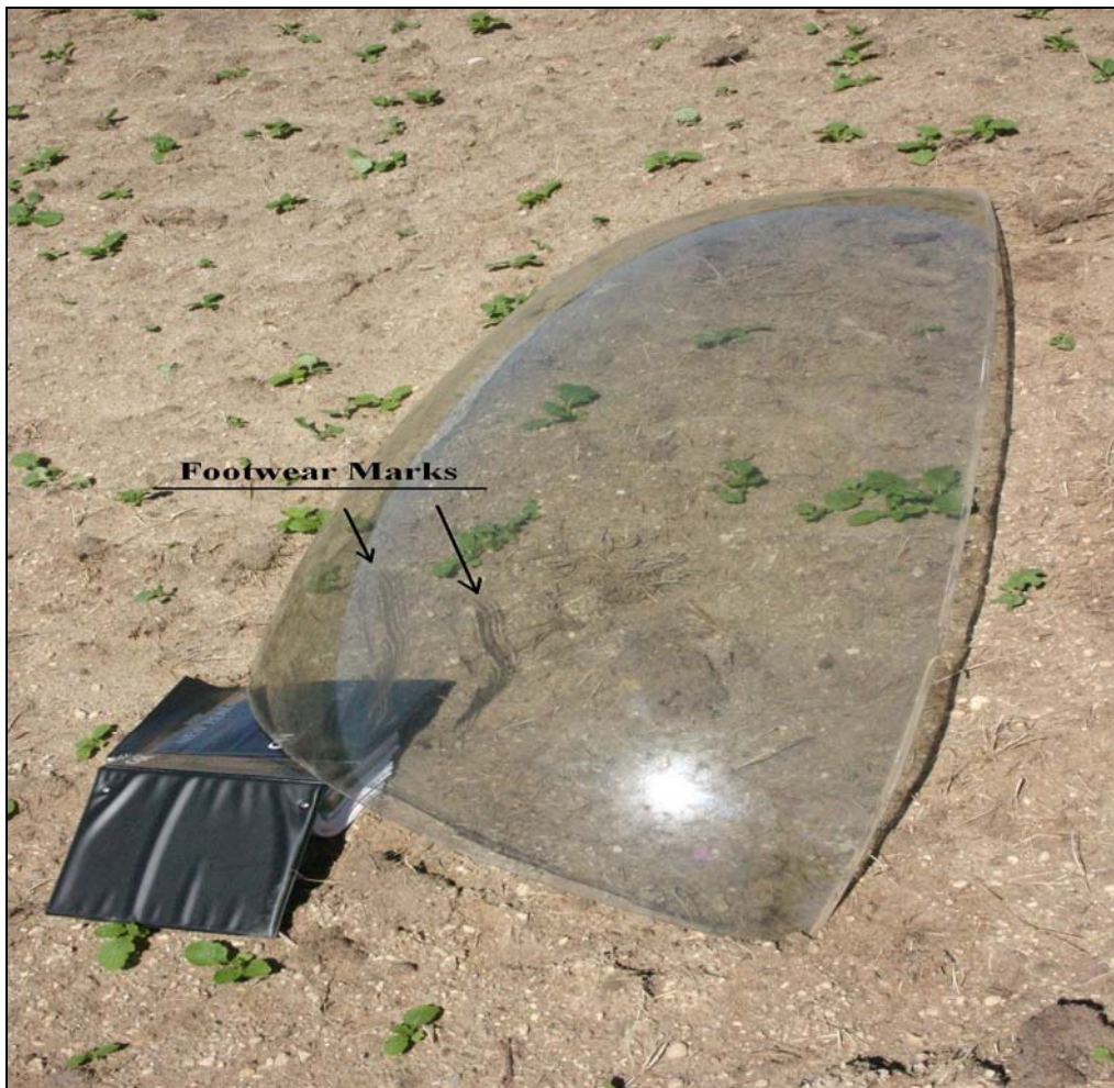
Figure 3: Pilot's windscreen with footwear marks. Note abrupt change in direction.