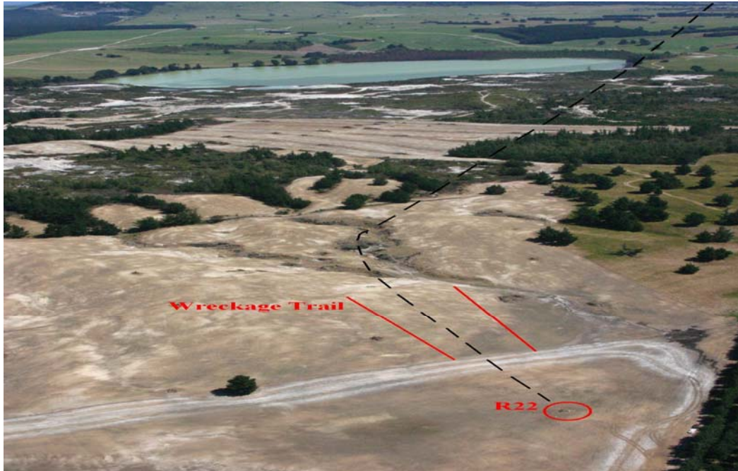
Figure 4: The flight path from the race course required a turn to align with the wreckage trail. Note the small “foot print” of the wreckage trail and two circuits of the paddock by the fertiliser truck.