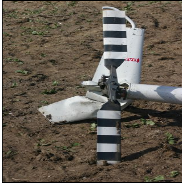
Figure 2 Tail section showing crushed vertical upper fin from inverted impact and no evidence of tail rotor rotation.