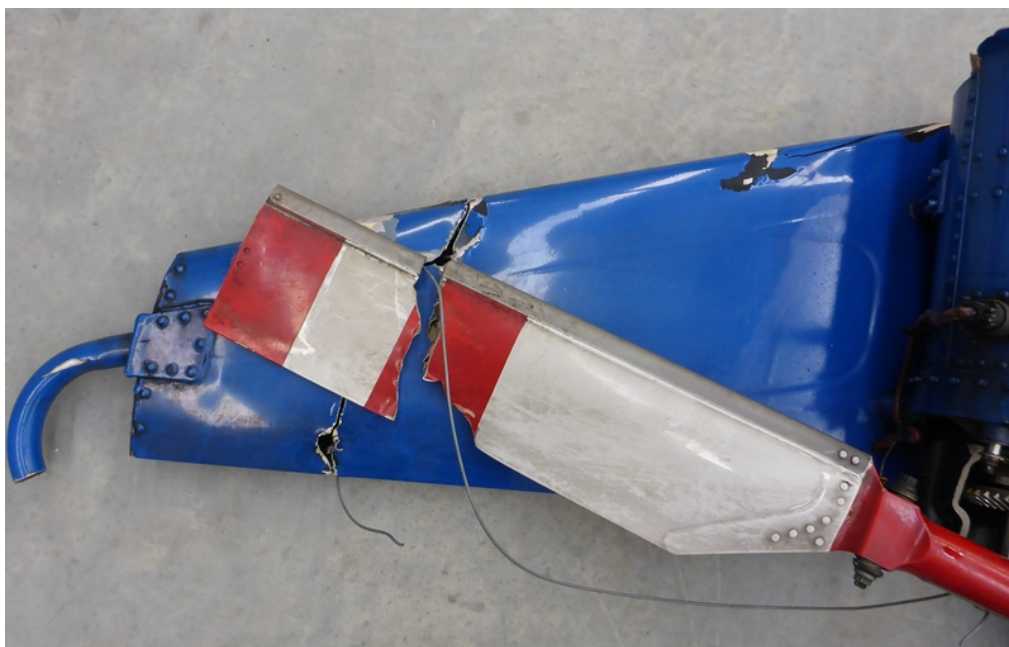
Figure 5: Tail rotor blade failure

Witness marks on the failed tail rotor blade indicated that the blade failed after having contacted the wire. The position of the length of wire embedded in the lower vertical stabiliser coincided with the position of where the tail rotor blade had failed. (Refer Figure 5).