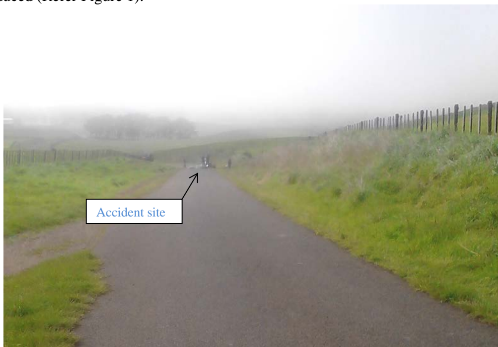
Figure 1: Weather conditions 10 minutes post-accident

Early morning fog in the area had delayed the start of spraying operations at the farm. By approximately 0910 hours the weather conditions had improved sufficiently for the spraying job to commence. The farm manager indicated during the CAA safety investigation that there were still some patches of fog in low lying areas, however the paddock that the pilot had started to spray was free of fog. It was noted from a photo taken by a local resident as they approached the accident site, approximately 10 minutes after the accident, that the fog had not cleared completely. There appeared to be no distinct clear horizon and horizontal visibility was reduced (Refer Figure 1).