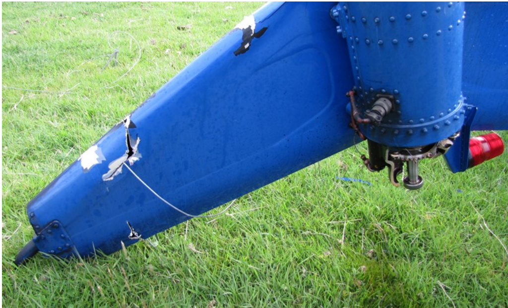
Figure 4: Electric fence feeder wire embedded in lower vertical stabiliser

The lower vertical stabiliser was found to have a length of wire embedded in the leading edge of the stabiliser (Refer Figure 4).