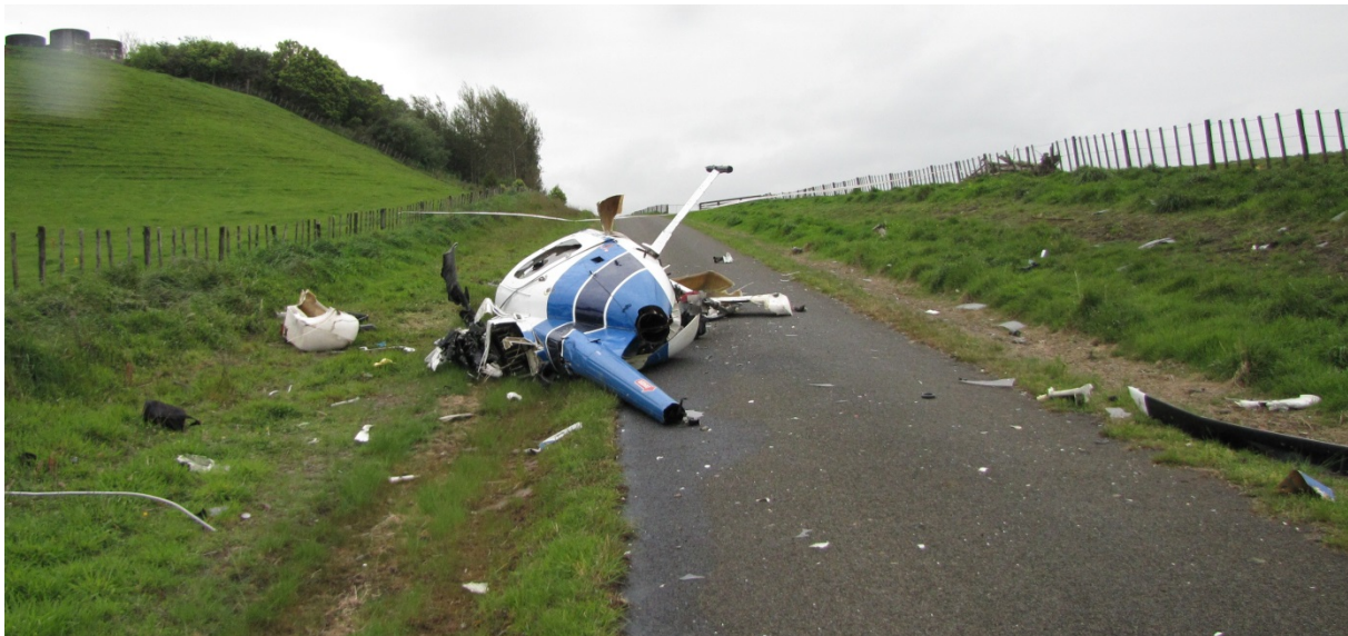
Figure 2: Accident site

Following a brief climb, the helicopter descended and the witnesses observed it strike the ground initially with the right skid. The helicopter then rapidly rolled over to the left landing heavily on its left side. The helicopter was largely intact and all parts were accounted for at the accident site apart from the aft stabiliser assembly and tail rotor. Signatures indicated that the main rotor system was under power at the time of ground contact.