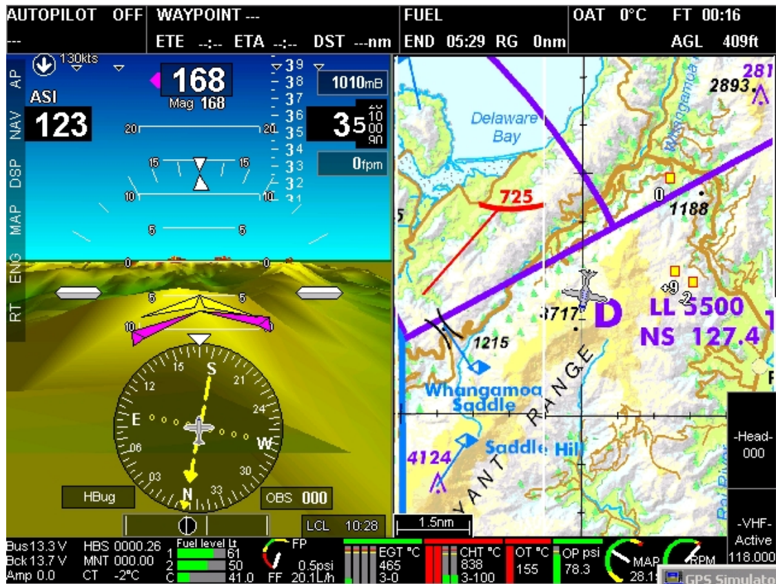
Figure 2: EFIS screen display

1.16.5 In response to this, MGL Avionics Ltd amended the New Zealand terrain data base by using higher resolution NASA terrain data to reflect the actual spot heights which greatly improved the terrain accuracy. As soon as the amended data base was available, all New Zealand users of the MGL Avionics Enigma and Odyssey systems were notified and supplied with the amended data base.