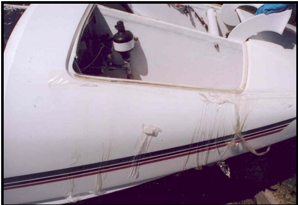
Figure 2: Failed Sellotape used to secure nose hatch for flight