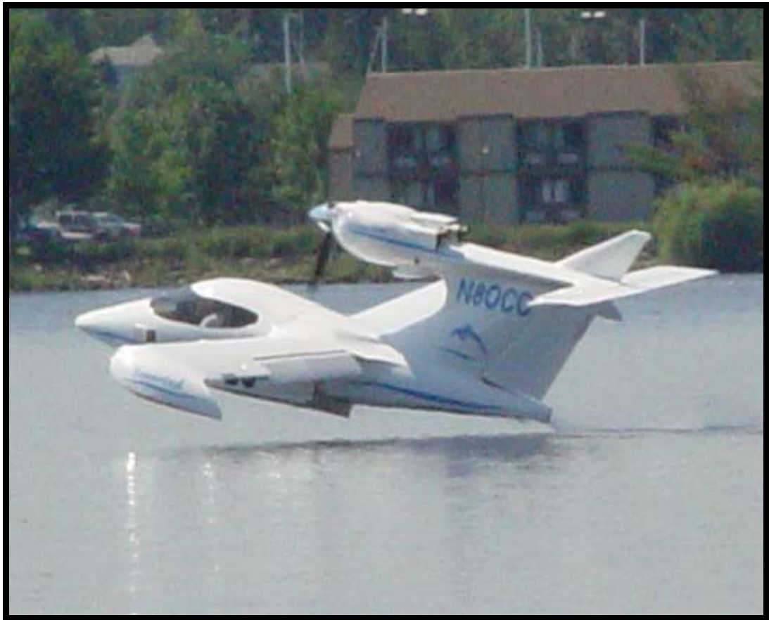
Fig 5: Typical take off attitude in smooth water conditions.