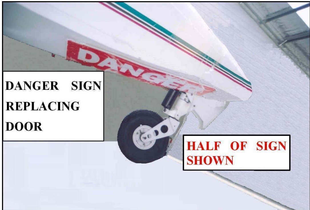
Figure 3: Danger sign fitment with one piece of Sellotape on each side. Nose landing gear would have been retracted.