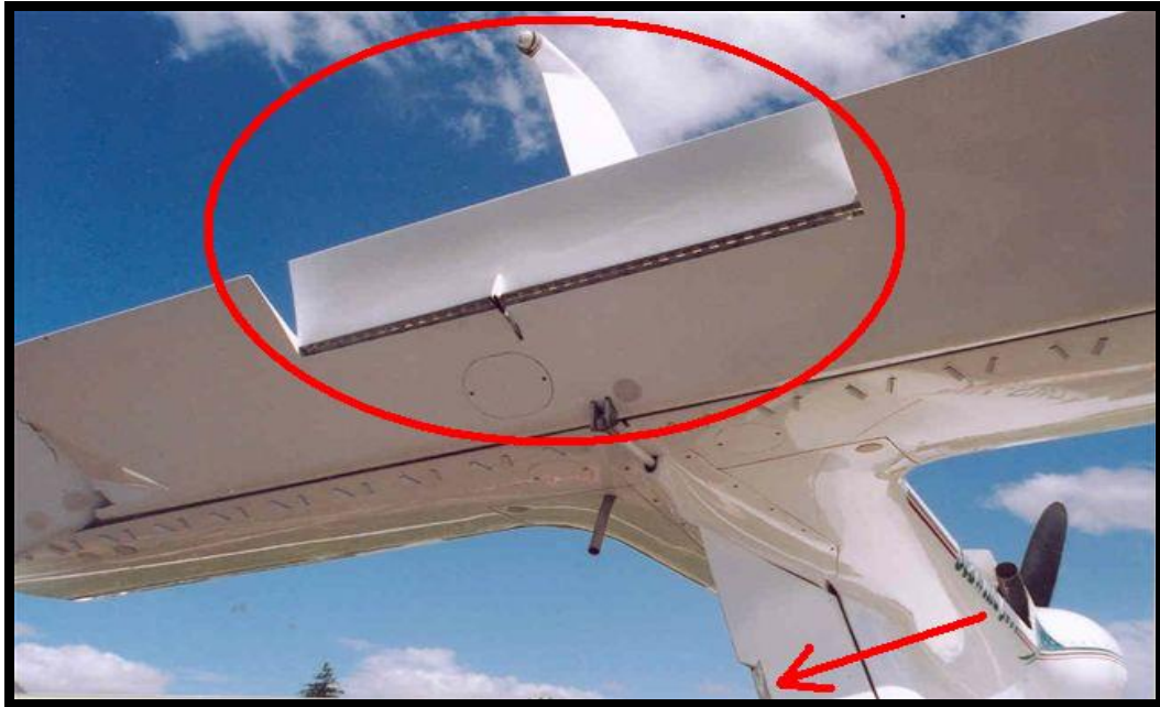
Fig 4: Elevator trim tab (circled) trimmed Nose Down, and rudder trim tab (arrowed) deflected full Right.