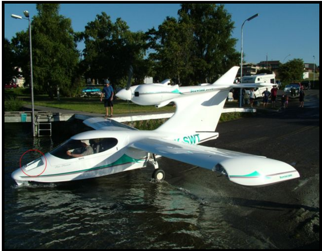
Figure 1: Missing hatch (circled) while leaving boat ramp for third attempt.

adjacent to the boat ramp. Here the aircraft was tilted over with the left wing down while the damaged nose area was worked on by the three homebuilder/pilots.