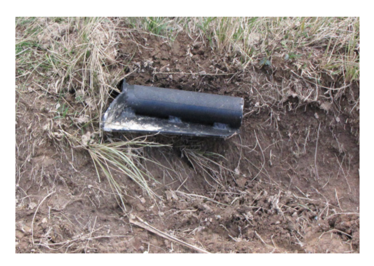
Figure 3. Snow shoe, demonstrating contact with edge of landing site.

1.12.4 A significant strike mark was evident approximately four metres aft of the snow shoe witness mark. This strike mark appeared to have been made by the tail rotor blades. The strike mark indicated that the helicopter was banked by approximately 45° when the strike occurred. The depth of the strike, (approximately 200 mm), matched the extent of organic material found on both tail rotor blades.