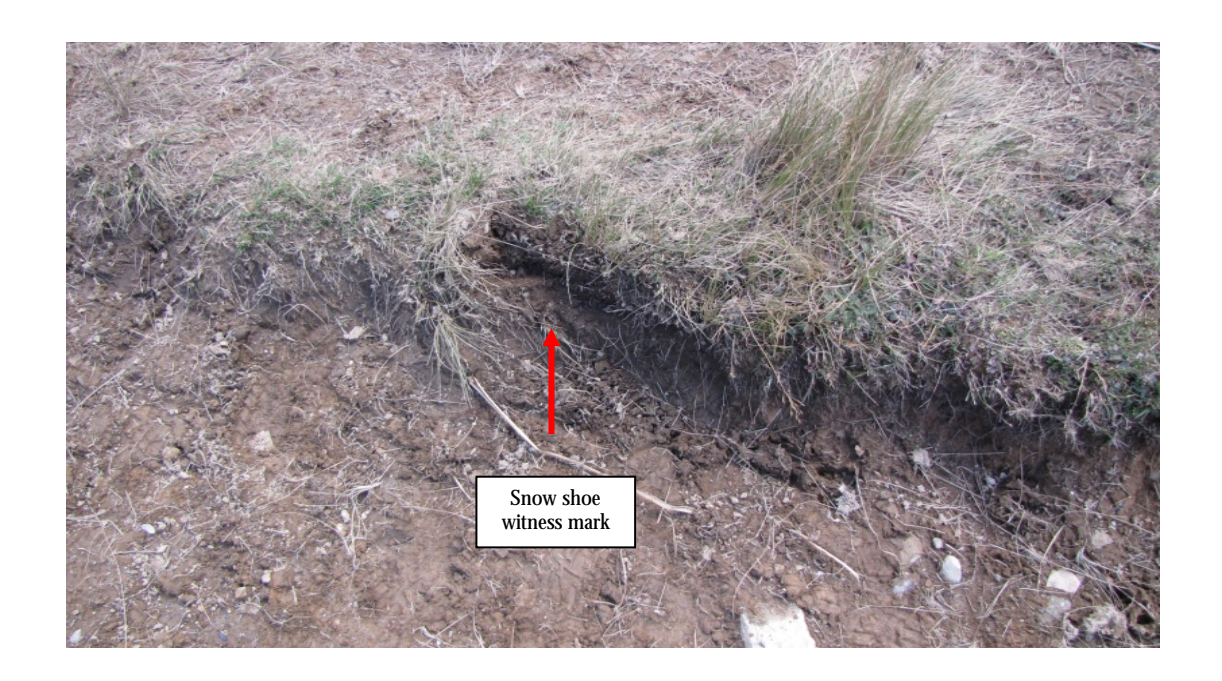
Figure 2. Witness mark from left hand snow shoe.