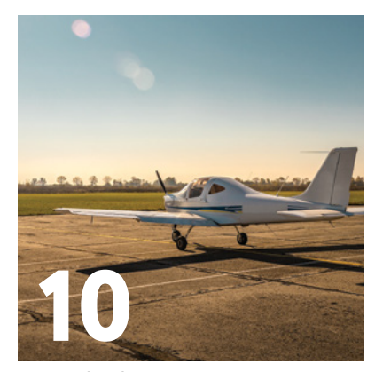
// RULES → SAFETY