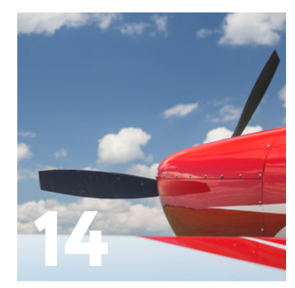
// SHARING THE RISKS