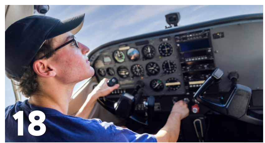
// LOOKING OUT 'CONSCIOUSLY'