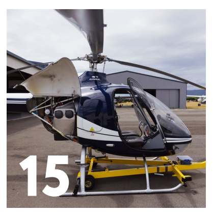
// I LEARNED ABOUT MAINTENANCE CONTROL FROM THIS...