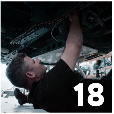
// THE FOUNDATION OF A STRONG ENGINEERING CULTURE