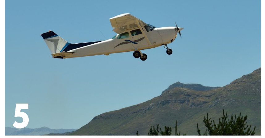
// THE SURPRISING FINDINGS ON MID-AIR COLLISIONS IN UNCONTROLLED AIRSPACE