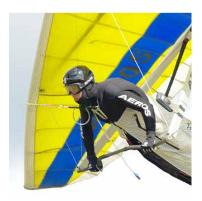
// This hang glider is being aero-towed by a microlight aircraft.

Hang glider and paraglider pilots often fly over difficult and remote terrain, so the CAA strongly advises the use of a PLB (personal locator beacon). Organisations should remind all pilots of this, including visitors from overseas.