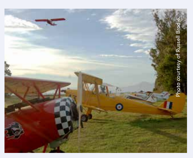
// Rangitata Island can be busier than Timaru aerodrome some days.

Like Forest Field, Rangitata Island can be a very busy place. It has two vectors, extensive NORDO microlight activity and standard join training.